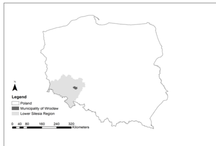
Figure 1. The location of research area on the background of Poland and Lower Silesia region.

The analysis of the current system of legal management of the urban landscape was carried out on the example of Wrocław, one of the largest Polish cities - the capital of Lower Silesia. Wrocław is located in the central part of the Lower Silesian Voivodeship, in south-western Poland (Figure 1). It covers the area of 292.82 km 2 and is inhabited by over 638 000 residents (30.06.2017). It borders with 8 communes, which form the suburban area of Wrocław. Geographically, the city lies on the Śląska Lowland, between the Trzebnickie Hills in the north and the Sudeten Foreland in the south at an altitude of 105 to 156 m above sea level. The Odra River and its four tributaries - Bystrzyca, Oława, Ślęza and Widawa - flow through the city.